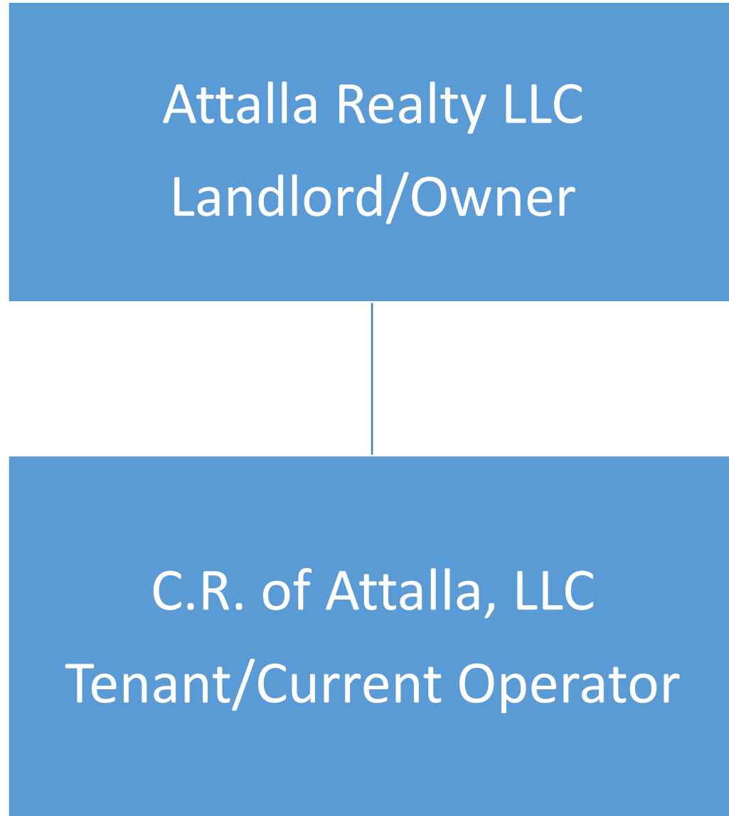
Current Organizational Chart